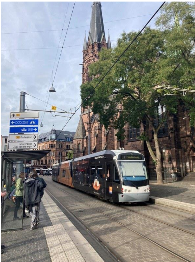
Train in the direction of Siedlerheim from St. John's Church stop

⇒ 360° link photo: https://goo.gl/maps/YZ7KvFSUYHabnqD19