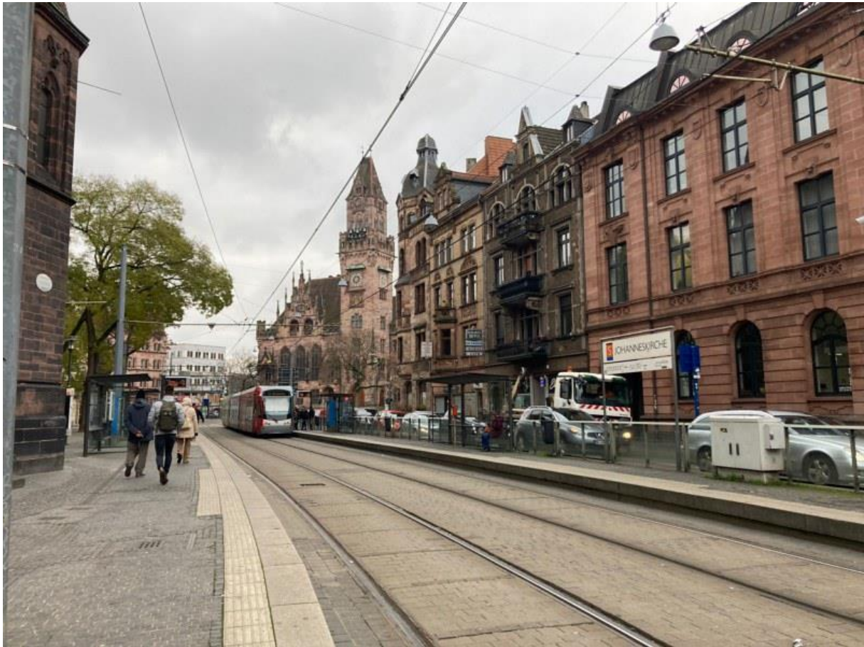
Landscape view of the St. John's Church stop

The St. John's Church stop is located on Cecilienstraße. The stop is so named because it is directly in front of the church and next to the town hall. The stop has 5 different destinations from St. John's Church (to Siedlerheim, to Riegelsberg Süd, to Heusweiler Markt and to Lebach). All trams run in the north direction. If you get off at Johanneskirche, you can take the city buses at the Rathaus stop (lines 101, 02, 103, 104, 105, 106, 107, 109, 110, 111, 121, 122, 125, 129 and 150).