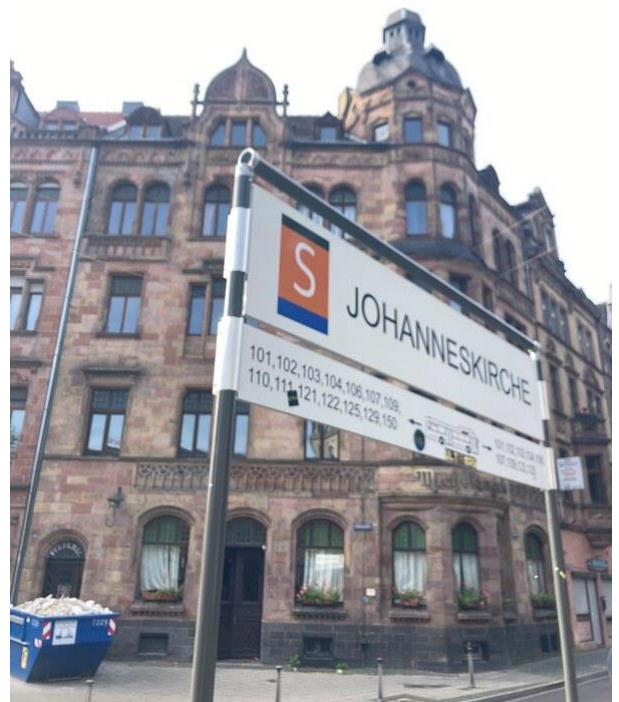
Bus stop sign at St. John's Church