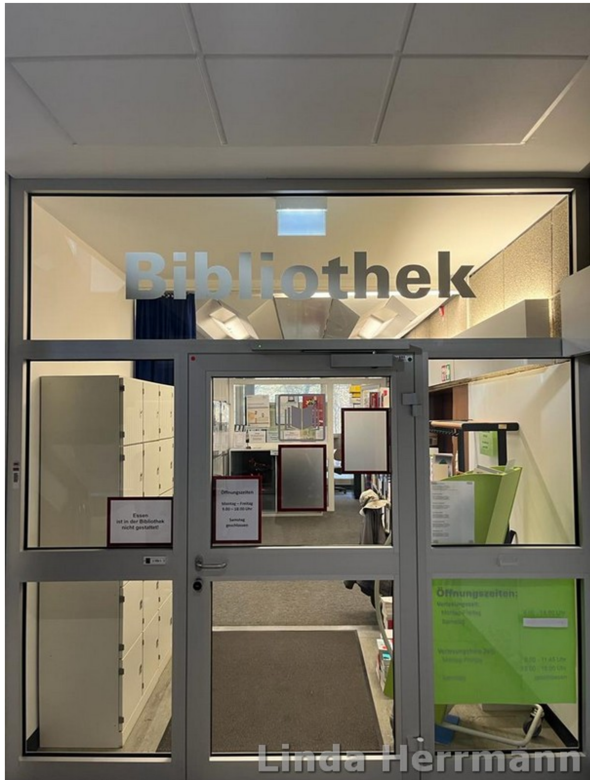
Entrance to the Rotenbühl Campus htw saar library. A glass door with „Library“ written in thick, white letters at the top.