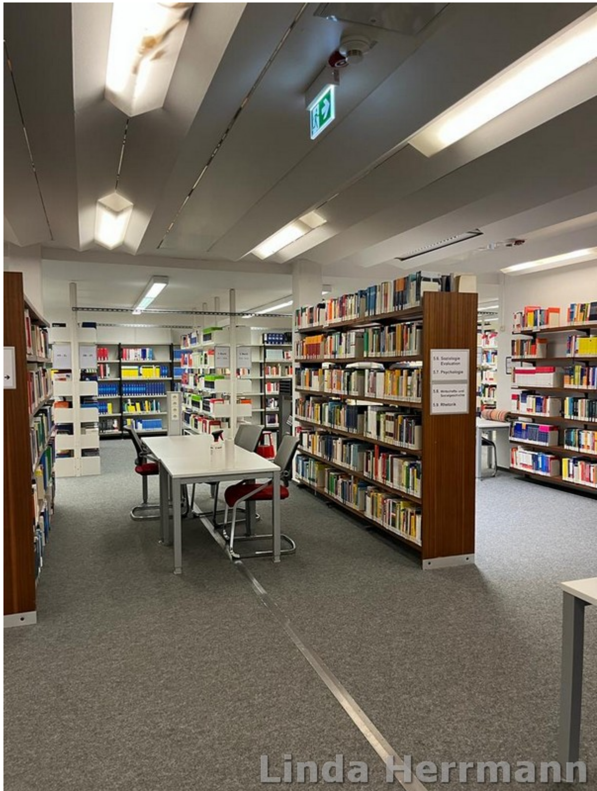
Photo of various bookshelves in the Rotenbühl campus library at htw saar. In the centre of the picture is a desk with three chairs.

The library at the Rotenbühl campus is a good place to study, especially for the economics students among us. Here you will find all the literature relevant to the module and there are usually enough places available. Here, too, you have