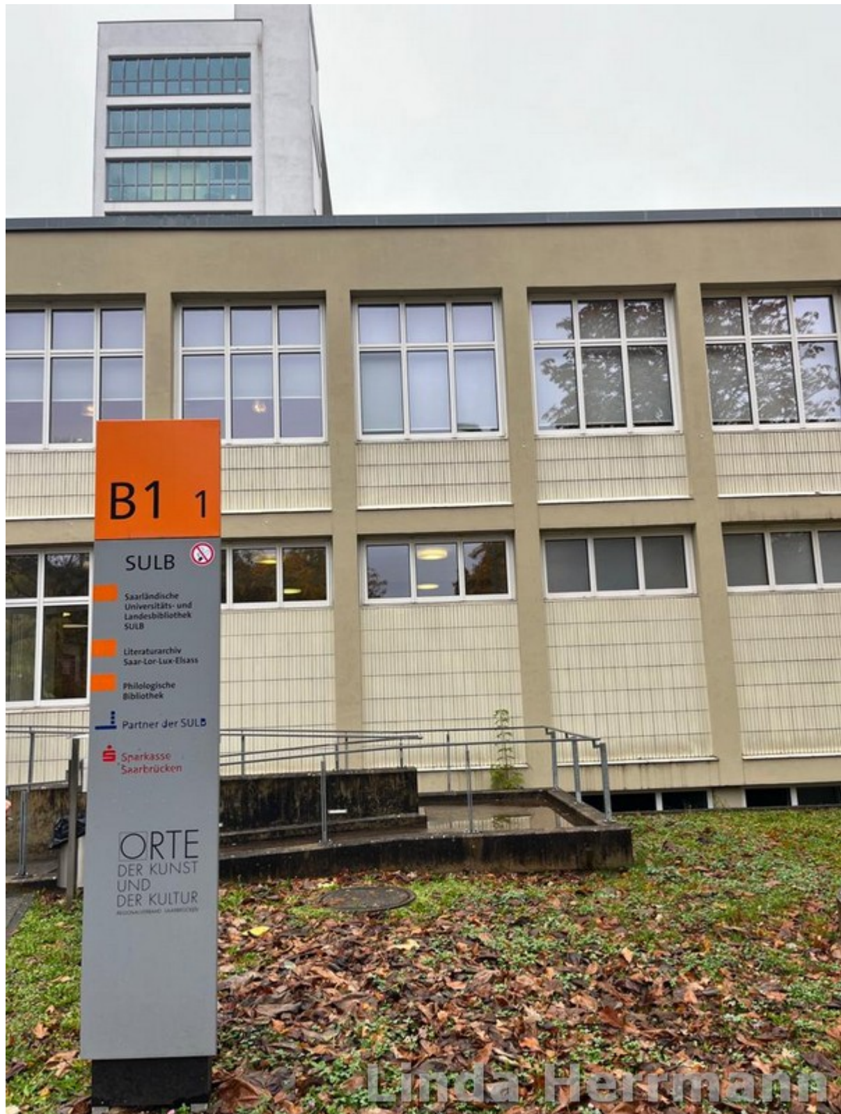
A grey, black and orange information sign in front of the Saarland University and State Library. In the background you can see a small part of the SULB; two brownish-yellow painted floors with windows. Behind it is a tall grey building, the last three floors of which can be seen.