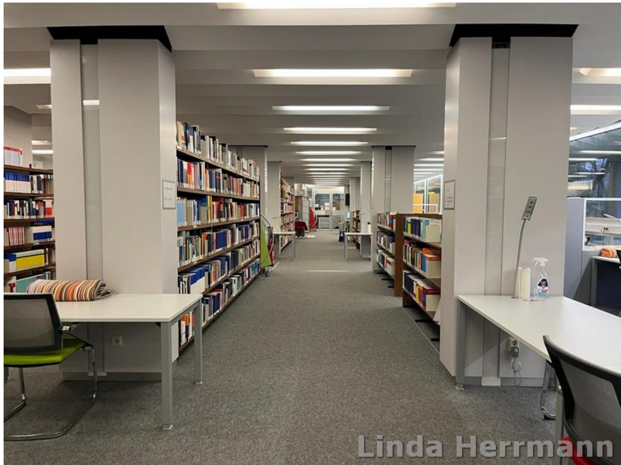
Photo of the Rotenbühl campus library of htw saar from the far end. You can see bookshelves and workstations.

adress library campus Rotenbühl htw saar, library campus Rotenbühl, Waldhausweg 14, 66123 Saarbrücken