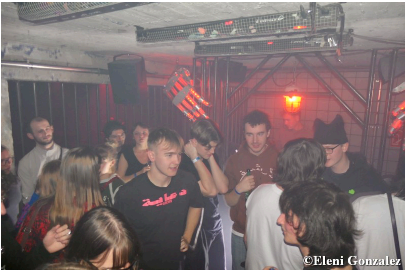
2010 party at Blau Nachtclub

The atmosphere in the club is just as diverse as the music on offer! Whether it's German rap, 2010 hits or techno, there really is something for everyone here. You can enjoy different music genres on a total of three dance floors. The club offers a varied programme that never ceases to amaze partygoers.