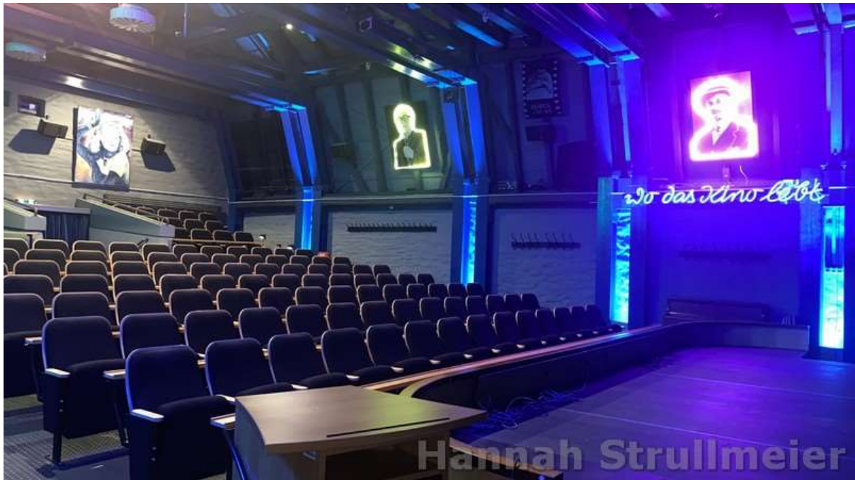
cinema auditorium of the Filmhaus

In conclusion, the Filmhaus is definitely worth a visit and offers many different options, even if you don't necessarily want to watch a movie.