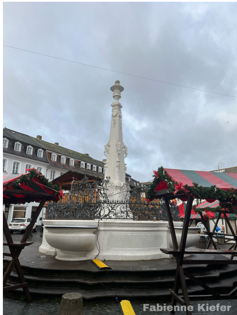
Stengelbrunnen am St.Johanner Markt

restaurants in the immediate vicinity where you can have a good time. You can also take a walk along the Saar to the Staden.