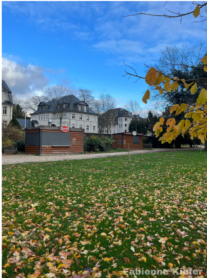
Getränke- und Essensbude am Ulanen-Pavillon

Whichever way you decide to go, the main thing is to be open, friendly and curious. New connections can be made anywhere if you are prepared to take advantage of the opportunities offered by your new city. Good luck meeting new people and discovering your new neighbourhood!